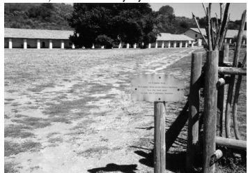
El Camino Real at La Purisima Mission