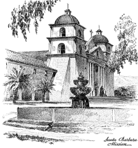
Mission Santa Barbara

In the early 20th century, Catholic Californians, proud of the state's Spanish and Catholic heritage, rebuilt the missions. Most now function as parish churches. La Purisima Mission is a state park, reproducing mission life in great de-